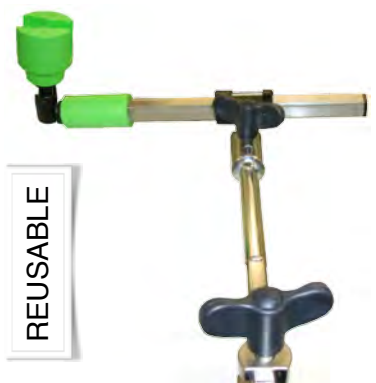
SurgiAssist Uterine Positioner (SUP-02)